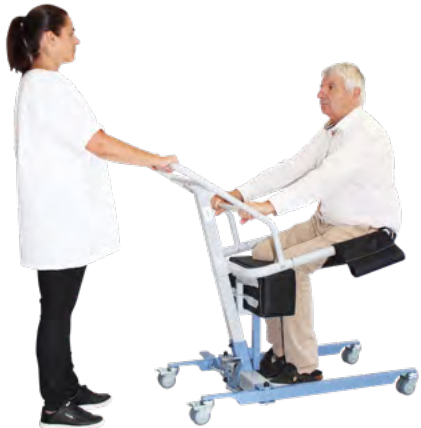
2. A secure seated or standing transfer system