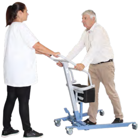
3. A walking aid