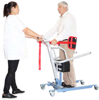
1. A lifting aid handlebar

The ACTIV'UP is a versatile device for active transfers as it is: