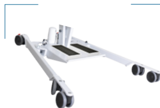
Electrical opening legs for ease of use