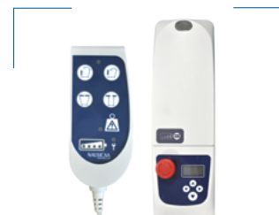
Premium control box for an enhanced use