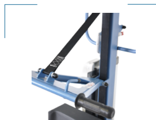
Traction belt for a combined movement increasing patient comfort