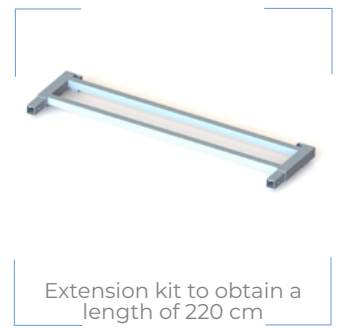
Extension kit to obtain a length of 220 cm