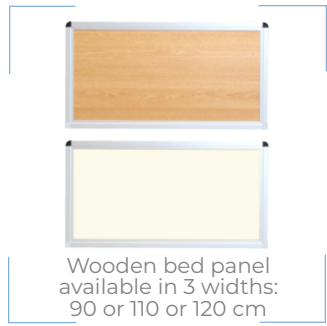
Wooden bed panel available in 3 widths: 90 or 110 or 120 cm