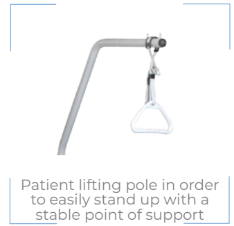
Patient lifting pole in order to easily stand up with a stable point of support