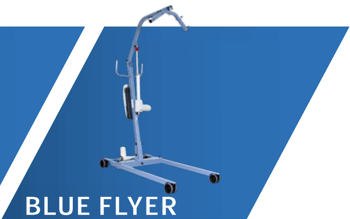
BLUE FLYER With Electrical Opening Legs