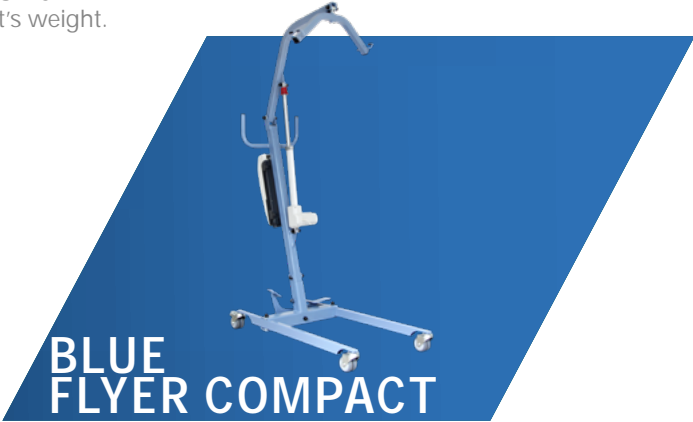
BLUE FLYER COMPACT With Mechanical Opening Legs