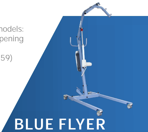
BLUE FLYER With Mechanical Opening Legs