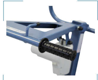
Fixed handles for a tight grip