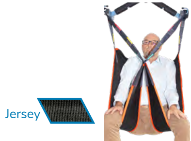
U-Shaped Sling Comfort Model

We recommend using them for transfers of bariatric patients.