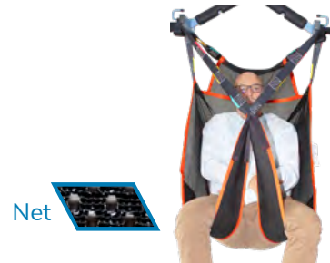
U-Shaped Sling Bath Model