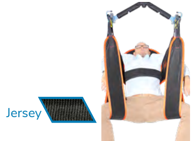
Quick Toilet Sling