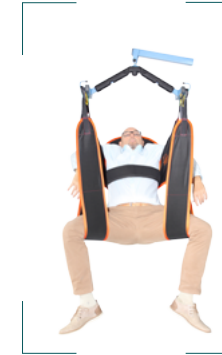
Quick Toilet Sling