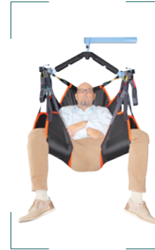
Hammock Without Crossing