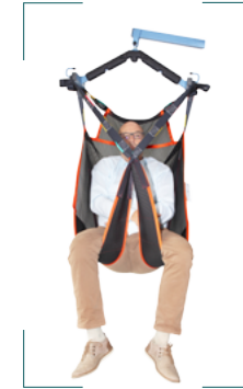
U-Shaped Sling bath model