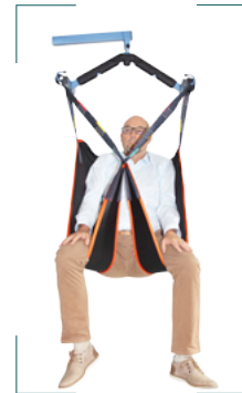
U-Shaped Sling comfort model