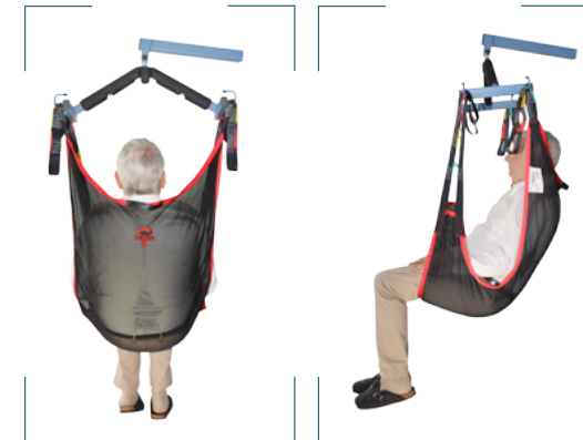
Presented model: with sewed headrest version