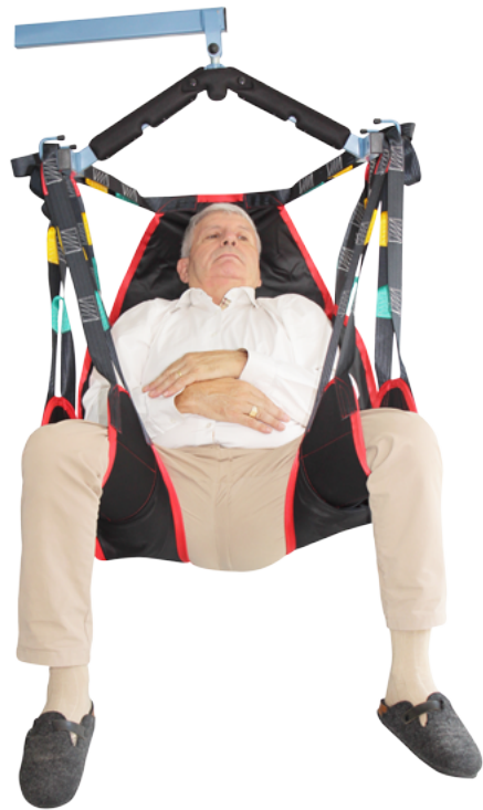
Presented model: headrest version