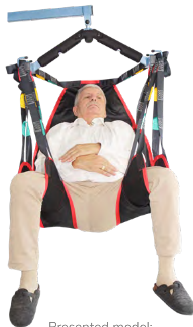
Presented model: with sewed headrest