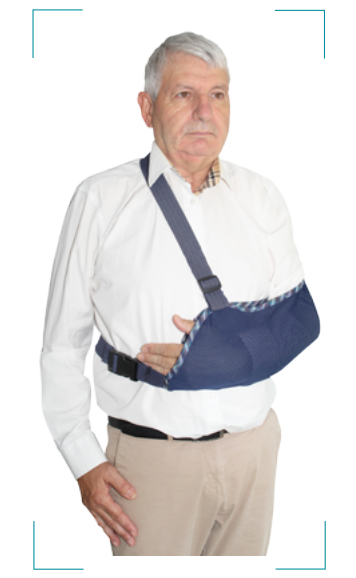
Arm sling with dorsal strap

The addition of a dorsal strap keeps the sling against the user's body (dorsal strap model only).